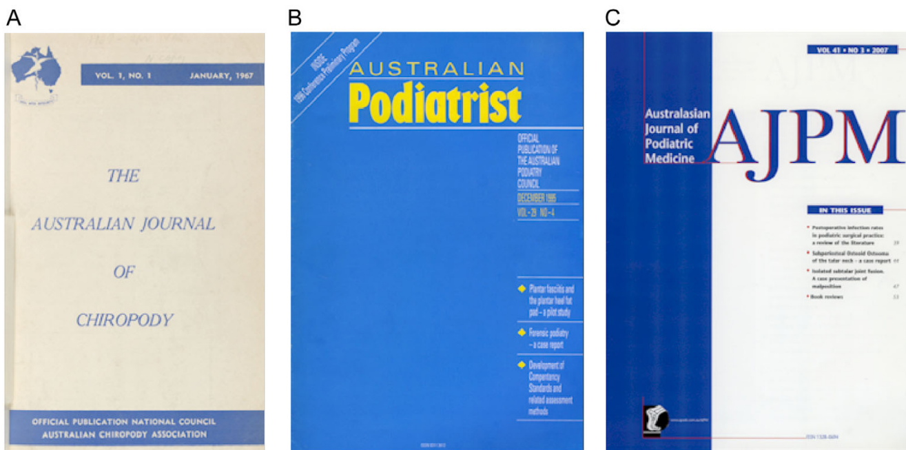
Figure 3 Chronology of chiropody/podiatry publications in Australia. A: The Australian Journal of Chiropody , B: Australian Podiatrist , C: the Australasian Journal of Podiatric Medicine .

The re-evaluation of scholarly publishing by the Australasian Podiatry Council and Society of Chiropracists and Podiatrists coincided with a major upheaval in biomedical publishing. Motivated by the growth of the internet and a desire to enable wider access to scientific information, the concept of open access publishing gathered considerable momentum in the late 1990s [11-14]. Open access publishing enables researchers to submit manuscripts to web-based journals that can be downloaded free of charge by anyone with an internet connection, with no subscription or registration barriers. The costs of publishing are borne by the author, or, in most cases, by the author's institution or funding body. In this way, access to scholarly information is vastly increased, and the costs of publishing research are contained. BioMed Central [15], the publisher of JFAR , is the world's largest open access publishing company, and currently produces 186 journals.