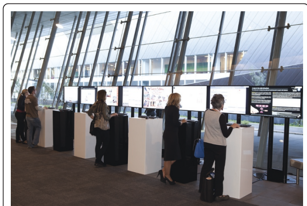
Figure 5 The virtual poster display area.

literature review” [23]. Glyceryl trinitrate is widely known to be a very effective vasodilator for the treatment of angina, but may also facilitate wound healing with a mechanism of action similar to hyperbaric oxygen therapy. This presentation provided a comprehensive overview of the topical application of this therapy for wound management.