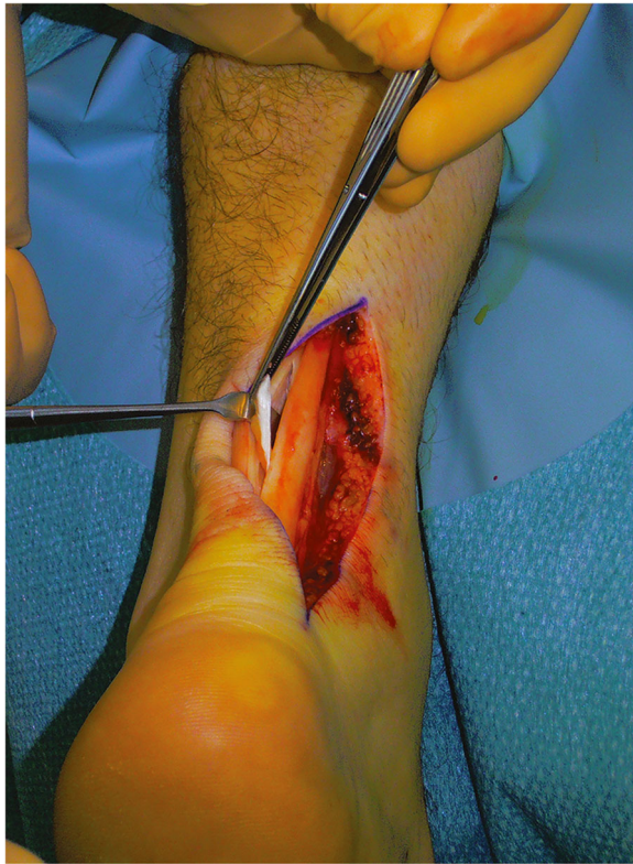
Fig. 1 Open surgery for tendinopathy of the main body of the Achilles tendon. The tendinopathic tissue is identified and then excised

semitendinosus, and the flexor hallucis longus tendons can be used as tendon grafts [68–70] (Fig. 2).