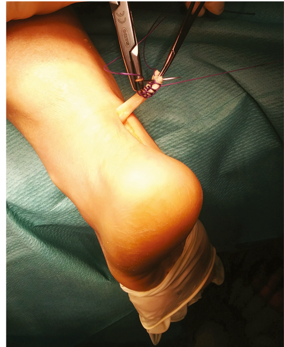
Fig. 2 Autograft reconstruction for chronic Achilles tear. The Flexor hallucis longus tendon graft was harvested through a longitudinal medial incision along the distal portion of the Achilles tendon

This procedure can be performed in the clinic under local anaesthesia without a tourniquet, but it is important to be careful, since even in minimally invasive procedures complications are possible. The tendon is accurately palpated, and the area of maximum swelling and/or tenderness marked, and checked by US scanning [6]. A #11 surgical scalpel blade is inserted parallel to the long axis of the tendon fibres in the marked area in the centre of the area of tendinopathy. The cutting edge of the blade points caudally and penetrates the whole thickness of the tendon [40]. During this procedure, full passive ankle flexions is made, with the scalpel blade being retracted and inclined several times. Active dorsiflexion and plantar flexion of the foot are encouraged early after surgery [40].