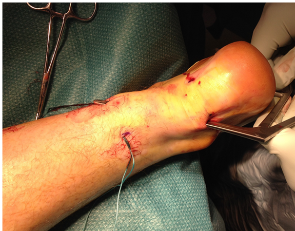
Fig. 3 Minimally invasive percutaneous stripping for chronic Achilles tendinopathy. The 4 small incisions are visible, with the surgical instruments passing through

as one of the explanations to the frequently favourable effect of surgery [74].