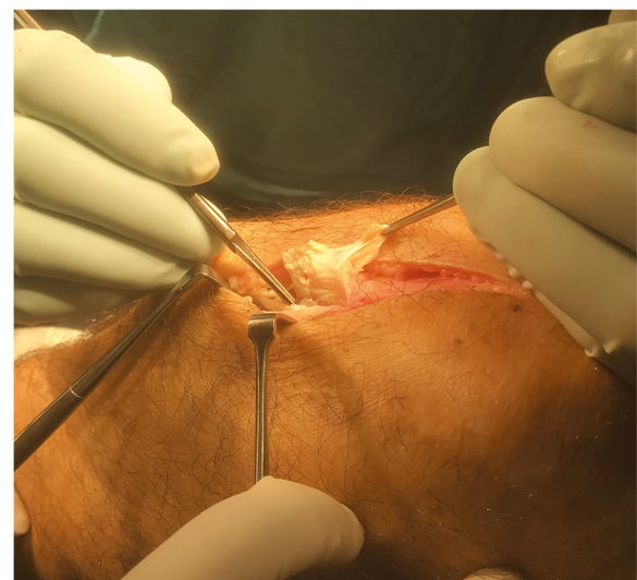
Fig. 4 Open surgery for patellar tendinopathy. Excision of the tendinopathic area

Open surgical techniques include opening of the peritendon, removal or drilling of the patellar pole, multiple longitudinal tenotomies and excision of the tendinopathic area [129, 130] (Fig. 4). These are not technically demanding, are reasonably fast to perform and inexpensive, and provide a high rate of good and excellent outcomes in the long term in patients unresponsive to non-operative treatment [131]. Using a midline longitudinal incision and after excision of the paratenon, the tendon is exposed and separated from the Hoffa's body by blunt dissection. The tendon is palpated to locate any tendinopathic lesions, which usually present as an area of intratendinous thickening. Three longitudinal tenotomies from the lower patellar pole to the tibial tubercle are made, and the tendinopathic areas are excised. The tendon and paratenon are not repaired. A wool and crepe bandage is applied and kept in place for 2 weeks. The tissues excised can be fixed in 10% buffered formalin and sent for histology analysis [132, 133]. Maffulli et al. [131] evaluated the return to sport activity using open technique in two group of patients, one with unilateral and the other with bilateral tendinopathy. At the final follow-up, in both group, the VISA-P scores [126] were significantly improved compared to preoperative values, with no intergroup differences, concluding that